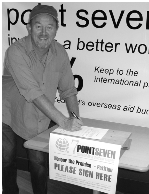
Dave Dobbyn lends his support and signs the petition.